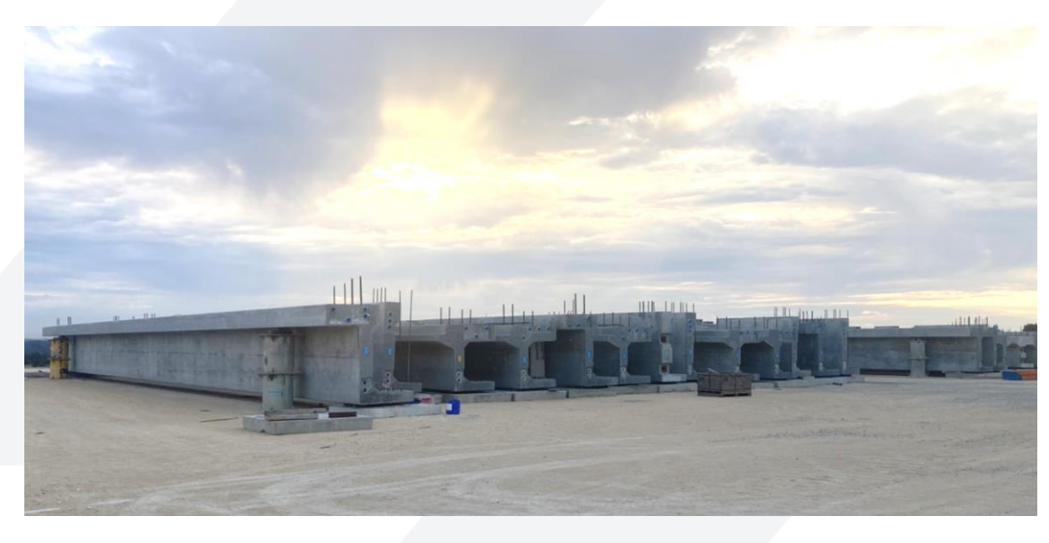
Bayswater Train Station Beams