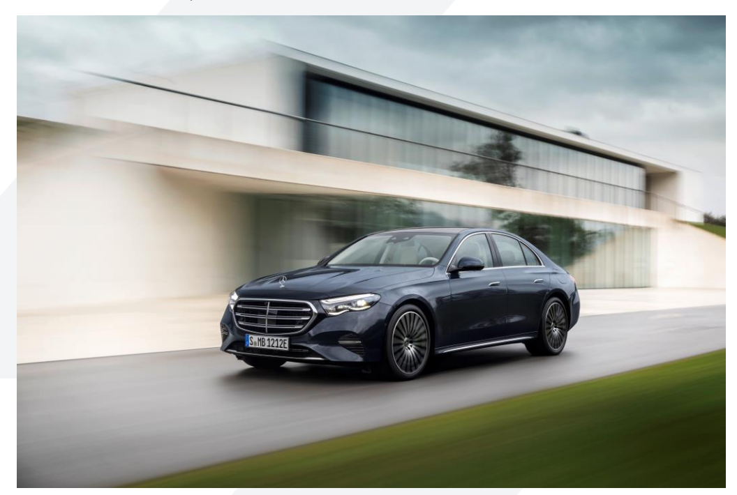
New Mercedes E-Class

Revenues increased to $143 million (FY22: $136 million), NPAT was down 39% to $11.1 million (FY22: $18.1 million). Revenues, operating margins, productivity and cashflow were impacted by: