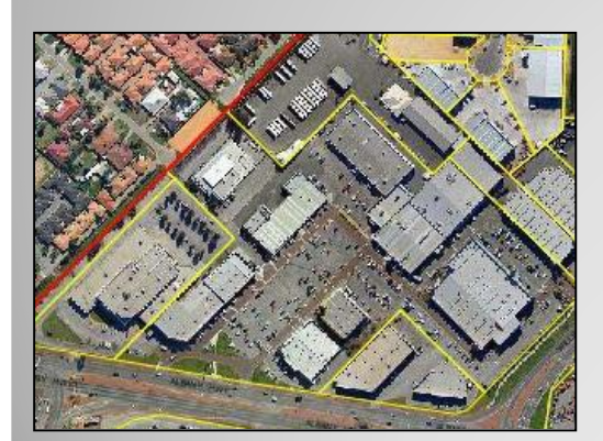
Hometown Cannington, WA