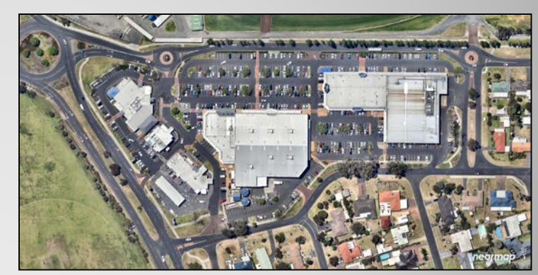
Parks Centre, Bunbury, WA